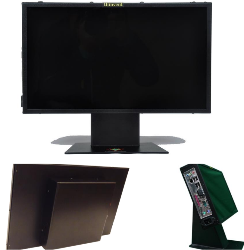
Rear View of Uno 16T slim thin client

Option of touchscreen and built in battery.